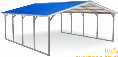
Includes 6" overhang on all sides