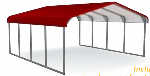
Includes 6" overhang on front & back